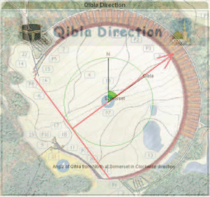
Qibla line, from Islam.com, points to Mecca

The whole country is now aboard this hijacked airplane. Most likely it will now take Congressional action to stop Murdoch’s Mosque. We need a full majority of the American people to stand up and say “no.” But unlike the heroes of Flight 93, we don’t have to give up our lives to tackle this hijacker. We just have to care.